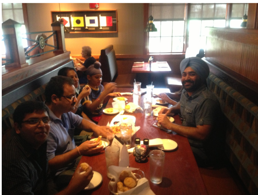
Newark "Qualifiers" with the great "Bali - The Baaniyaa"