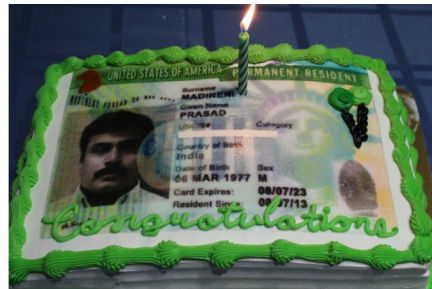
Cake me Green .... Cake me Green ..... Was the call of the day!!