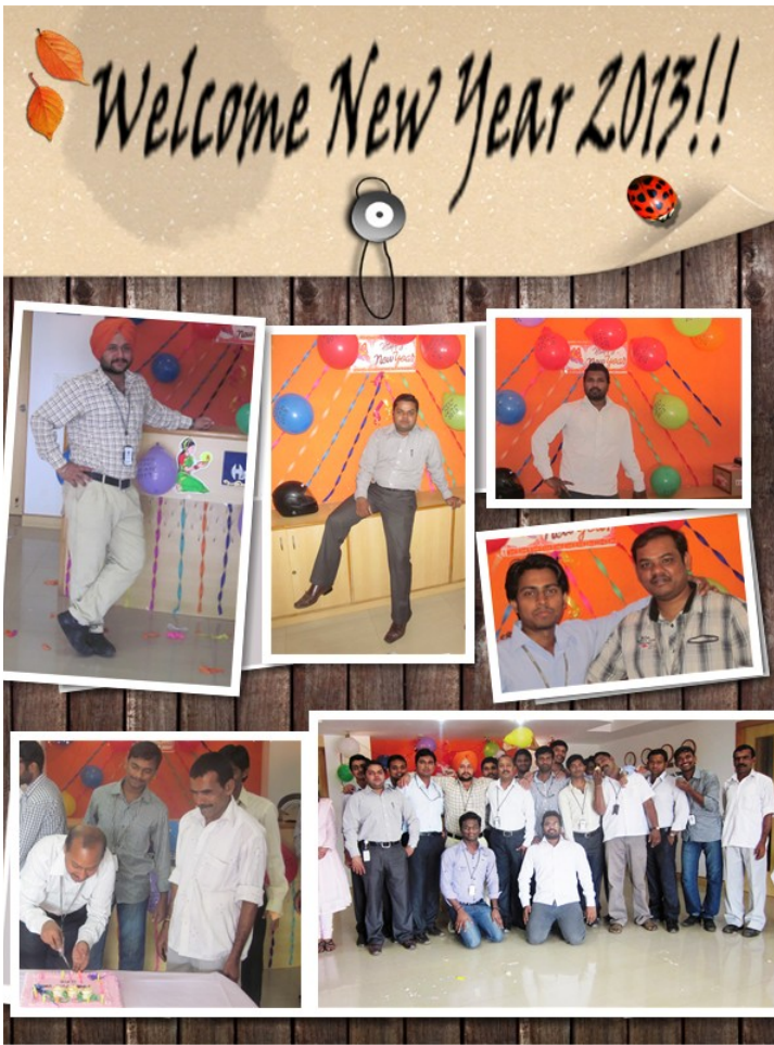
Celebrating the arrival of 2013 with poses and in style!! Qualitimes wishes all a very happy and prosperous year ahead!