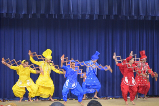
Young sikh boys and girls performing the lively Bhangra dance.

With me in Eisenhower Executive Office Building were other Sikh ladies and gentlemen, around fifty of them altogether from all over the US. Overwhelming majority of them was there for the first time because other have-been-before-to-the White House invitees as Ajay Banga (the MasterCard CEO) was busy making money I guess.