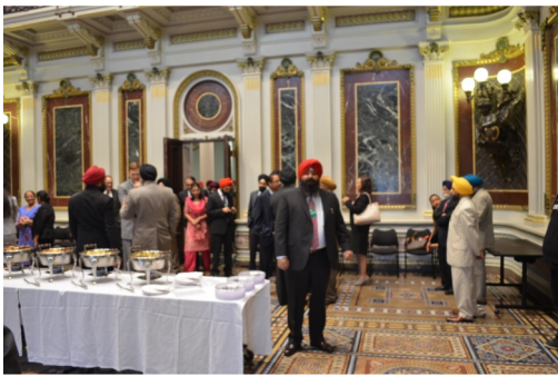
In the Indian treaty room with the great food and drinks around.

The session took off with Shabad Kirtan (call-and-response chanting or responsory), followed by speeches from WHO staff, officials of Department of Justice and Department of Homeland Security. They were not, "I speak; you listen", boring speeches but interactive sessions and a productive dialogue.